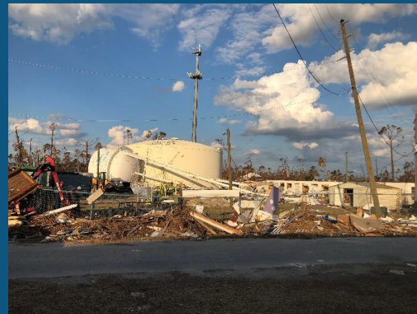
Hurricane Michael, 2018