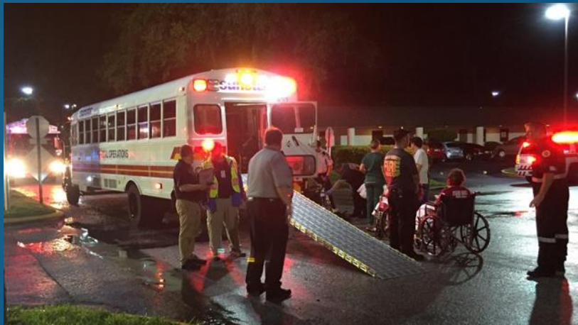
Hurricane Hermine, 2016